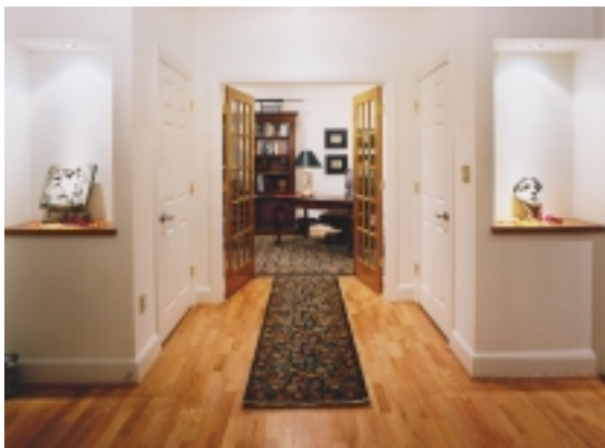
Carved niches highlight favored pieces of art