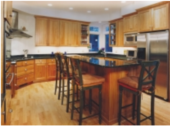
The kitchen sports stainless steel appliances, red birch cabinets and granite countertops